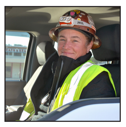
Alaska Department of Labor and Workforce Development